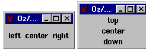
Fig. 2. Windows generated from lr and td expressions.

lr(label(text:"left") label(text:"center") label(text:"right")) td(label(text:"top") label(text:"center") label(text:"down"))