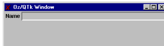
Fig. 3. Windows generated from a glue instruction.

lr(label(text:"Name" glue:w) entry(glue:we) glue:nwe)