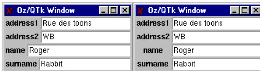
Fig. 1. Windows generated by applying mapping rules.

The idea of the model-based approach underlying QTk [7] is to map records describing starting models (typically, a domain model) onto widgets (typically, a presentation and a dialog model) according to the following mapping rules: a record is mapped onto a widget according to selection rules [19], its label is mapped onto the widget type, and any feature, e.g., to set the initial value, is mapped onto any widget parameter. The example label(text:"surname") declares a label widget which initially displays the text surname. The geometry management is defined by container widgets ( td for top-down and lr for left-right) and not by a separate mechanism. Functions 1 and 2 of Section 2.1.4 give rise to the windows depicted in Fig. 1.