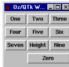
Fig. 4. Window generated from newline and continue instructions.

lr(button(text:"One" glue:we) button(text:"Two" glue:we) button(text:"Three" glue:we) newline button(text:"Four" glue:we) button(text:"Five" glue:we) button(text:"Six" glue:we) newline button(text:"Seven" glue:we) button(text:"Height" glue:we) button(text:"Nine" glue:we) newline empty button(text:"Zero" glue:we) continue )